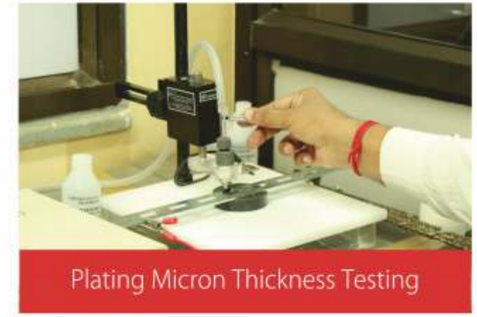
Plating Micron Thickness Testing