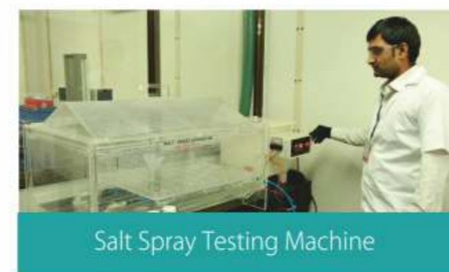
Salt Spray Testing Machine