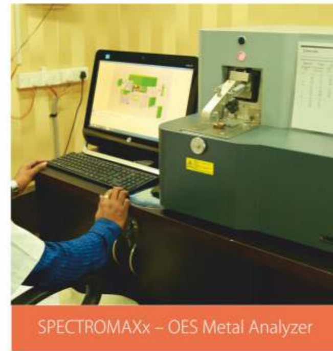
SPECTROMAXx - OES Metal Analyzer