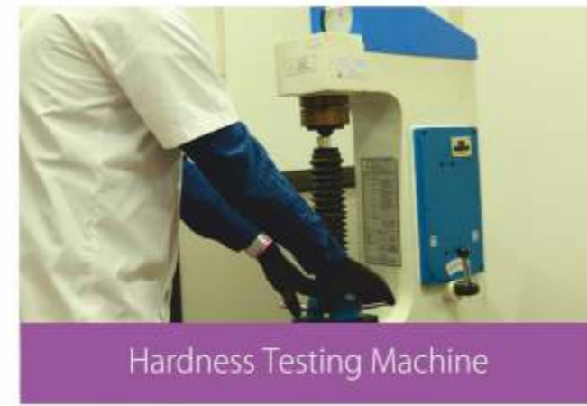
Hardness Testing Machine